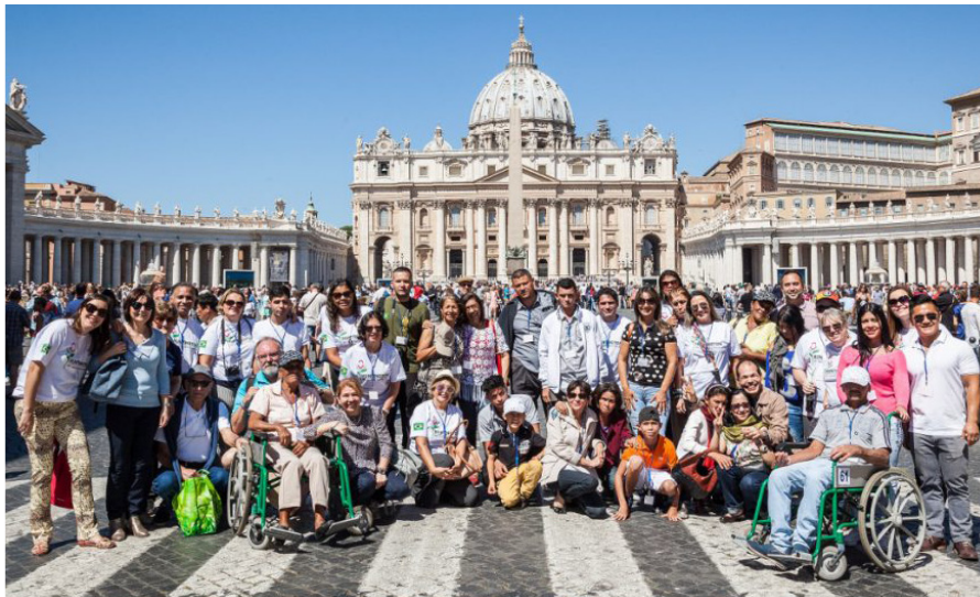
Members of the HD community gather in St Peter's Square