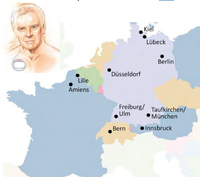
HD-DBS SITE MAP

map. Site contact details can be obtained from Pauline Kleger ( pauline.kleger@uniklinik-ulm.de ), and further details about the study criteria are available here .