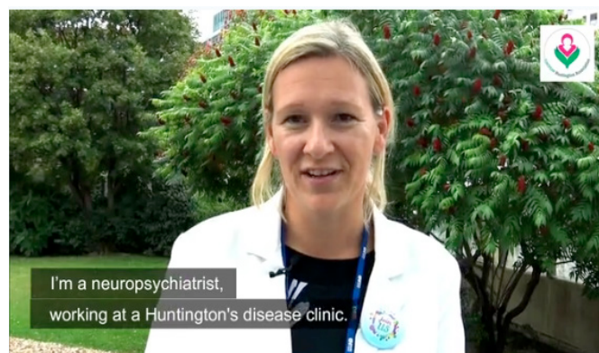
Photo: Ask the doctor

There are some countries where HD patients just aren't "visible" at all. Local neurologists may say that such patients are very rare in their country, so we have to