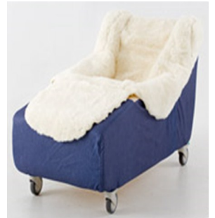
Table 2. Wheelchairs and seating systems for consideration